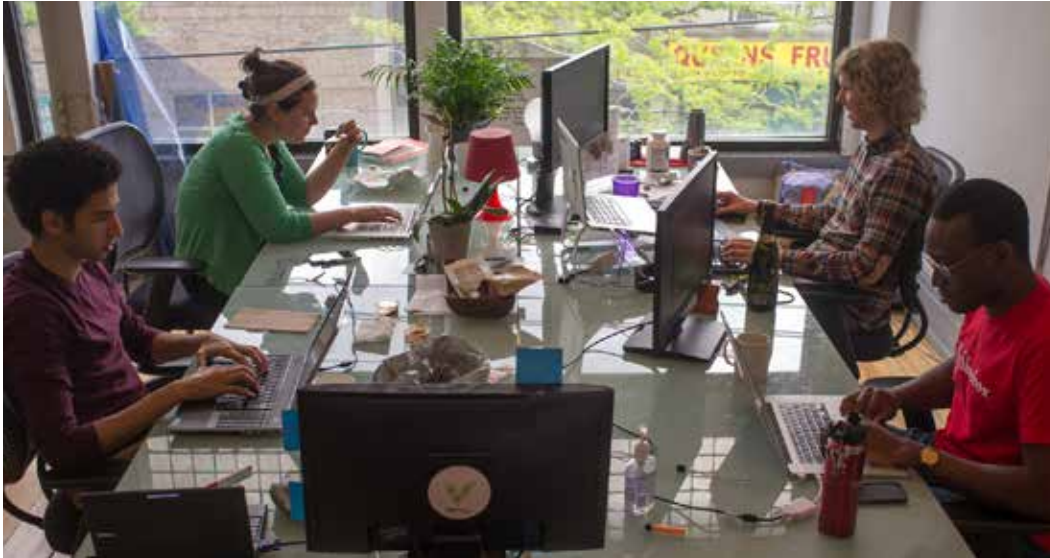
Extreme Startups, Toronto