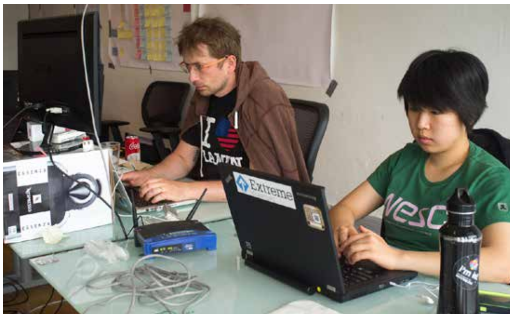
Extreme Startups, Toronto

More importantly, definitions of “success” vary across accelerators. For example, interviewees indicate that the number of patents filed by or granted to companies is important to most university-based accelerators, while job creation is a key outcome for government-supported programs. Both these metrics are less meaningful to venture capital-affiliated accelerators, which are focused on generating a return for their investors.